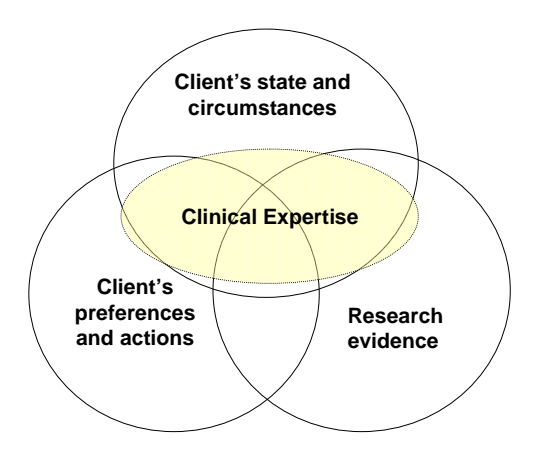
FIGURE 1: A model for evidencebased decisions (Gambrill, 2006)

determination of the diagnosis is a critical