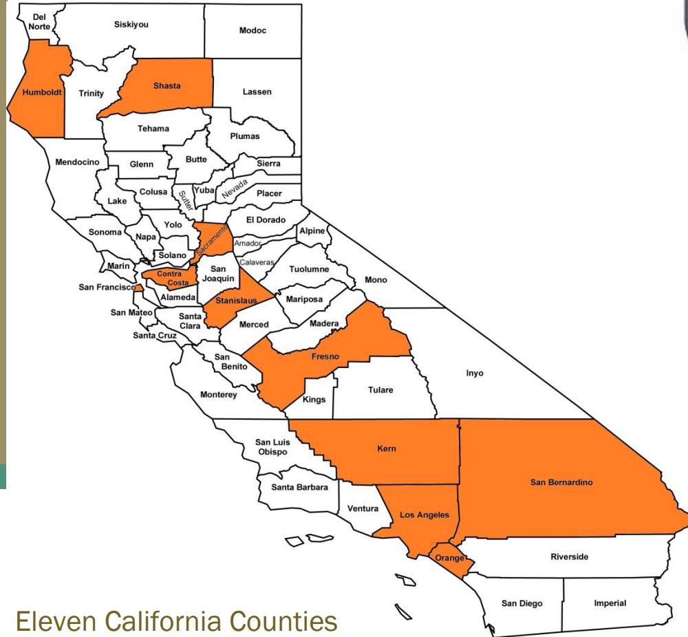
Eleven California Counties

BOARD OF STATE AND COMMUNITY CORRECTIONS